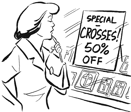
Shopping for a Cross

Jesus commanded His followers, “Take up the cross and follow me” (Mark 10:21).