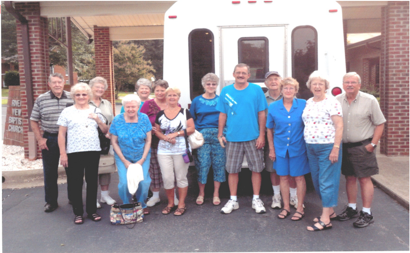
The Group made it to the cup house last month. On September 13, the group is planning to eat at North Star Seafood in Dallas and go shopping at Hamrick’s in Gaffney. Plans are to leave the church at 11:00 AM. We look forward to seeing you on the bus. Peggy Dellinger